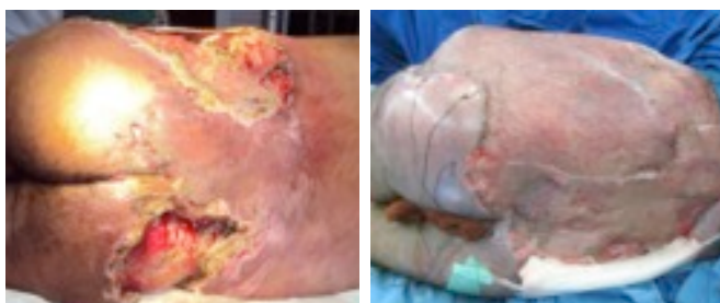
Figure 3. Case 2. a. First STSG were performed on the left flank and gluteal. Several stages of STSG were performed due to difficulty in patient positioning. (left) b. The patient's condition before surgery showed large degloving in the pelvic area with necrotic tissue and exudation. (right)