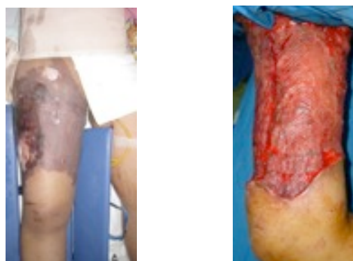
Figure 2. Case 1 a. Initial condition showed necrotic skin. (left) b. STSG seen right after operation Lateral side. (right)