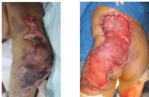
Figure 4. Case 3. a. Condition of the posterior trunk, 1 week after accident, showed necrotic tissue and hematoma. (left) b. Insetting of STSG to the gluteal and posterior trunk wound. Showing wound bed after coverage. (right)