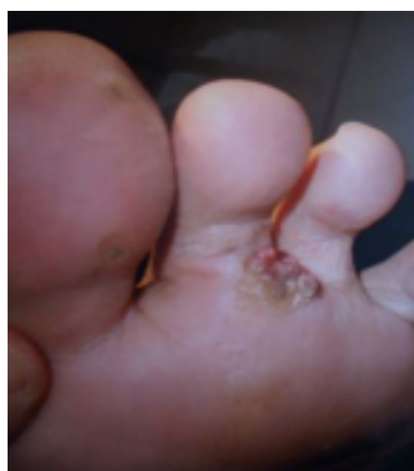
Figure 6. Note verruca lesion on 1 st digit, resemble callus or clavus. Compare it with the verruca on the 2 nd digit.