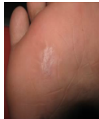
Figure 4. 4 month follow up Case 1. No