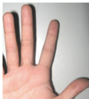
Figure 5. (Left) Hyperkeratotic hyperpigmented papular lesions on the right palm. (Right) Four months after polycresulent