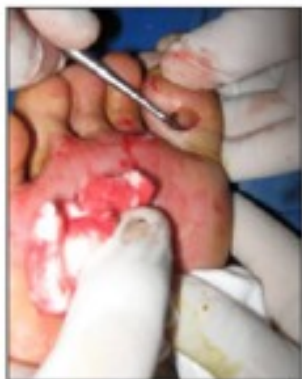
Figure 2. After incising the lesion outer edge, curettage was performed, No