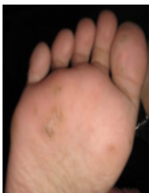
Figure 1. Multiple recurrent of verruca right plantar pedis, even after surgery.