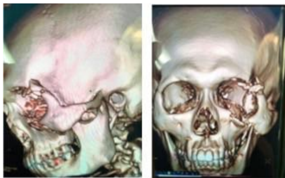
Figure 3. Three-dimensional CT-scan before reconstruction