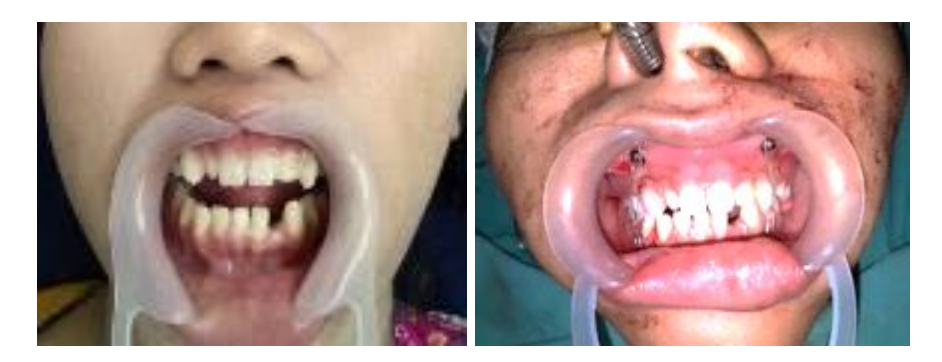
Figures 6. Pre- (left) and post-(right) surgery occlusion state