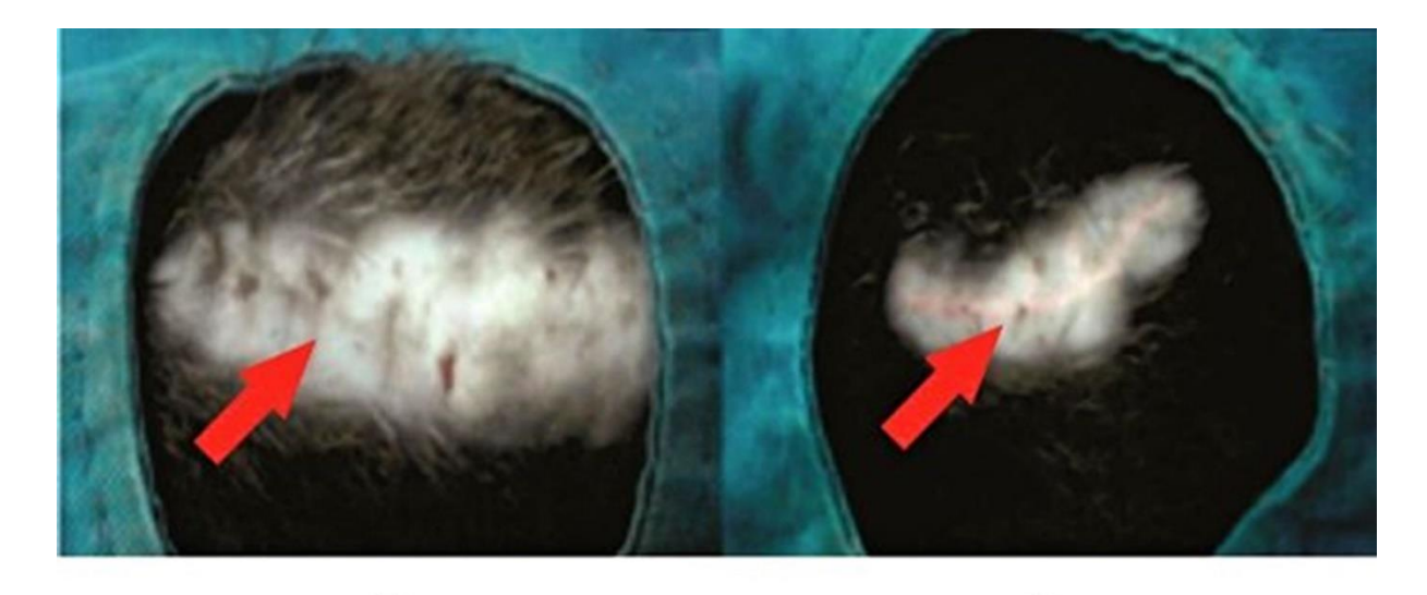
Figure 1. The wound scar in the control group (K) had a reddish color with less than 2 mm protrusion. The treatment group (I) also had the same color but no protrusion.

Copyright by Wihastyoko, HYL., & Wuryanjono, WP, (2022). P-ISSN 2089-6492; E-ISSN 2089-9734 | DOI: 10.14228/jprjournal.v9i1.335 This work is licensed under a Creative Commons License Attribution-Noncommercial No Derivative 4.0