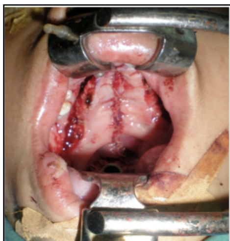
Figure 1. Lateral Palatal Defects Resulted from Two-stage Palatoplasty

In our study, we divided the epithelialization process to be before 2 weeks